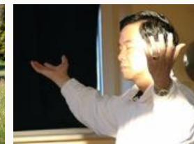
Wisdom Qigong can raise the consciousness in daily life