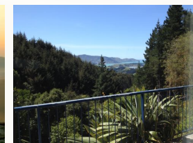
The venue and the rooms offer stunning views.