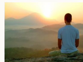
Tao of Silence - out of stillness appears motion again

- Tantien Qigong strengthens a good center in the lower abdomen, which allows to store more vital energy easier.