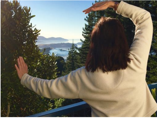
Photo taken from the veranda from the seminar room

Venue: Harbour View Lounge, Living Springs Center Banks Peninsula; near Governors Bay 20 minutes from Christchurch